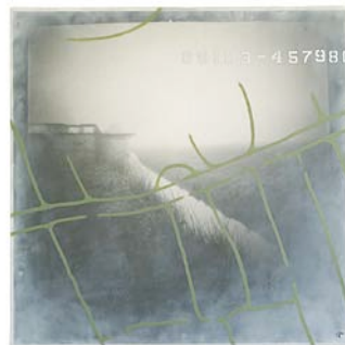
©2009-2010 Mixed media on panel, acrylic, inkjet print, encaustic, carbon, oil paint and salvaged materials from site (2007), 30.75" x 20.75"